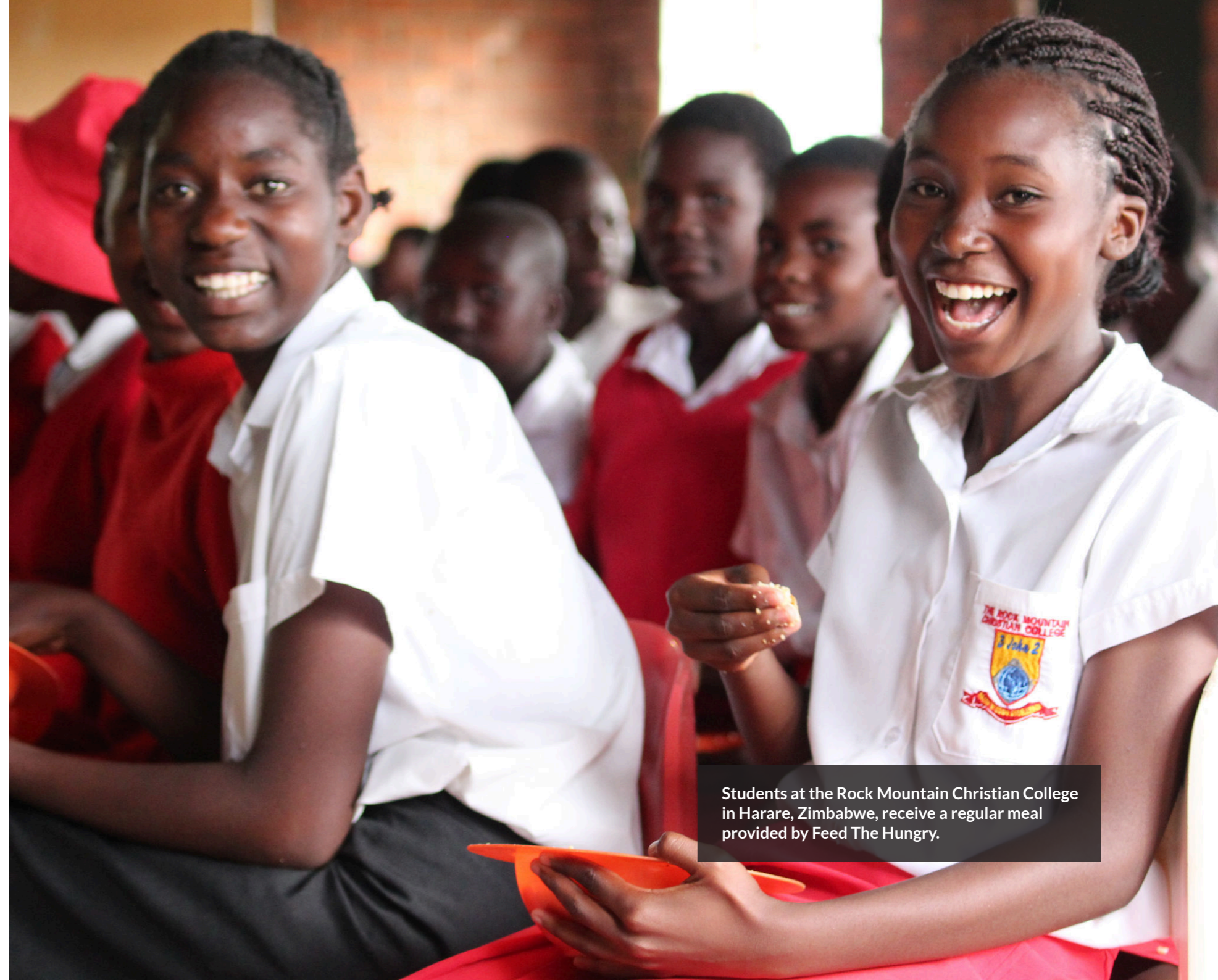
Students at the Rock Mountain Christian College in Harare, Zimbabwe, receive a regular meal provided by Feed The Hungry.

In addition, The Million Meal Miracle will help to connect local communities in the UK, creating partnerships between supporting businesses, churches and community groups, and their local schools.